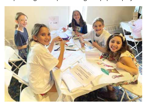
Grade 5 designed beautiful canvas bags for veterans at the VA facility. They also created cards with notes of appreciation to veterans.