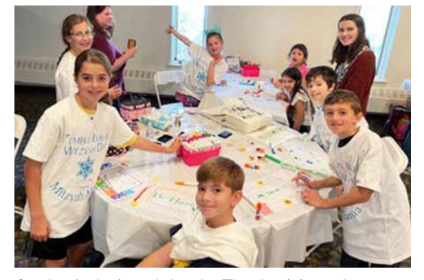
Grade 4 designed lovely Thanksgiving placemats which were inserted in food bags that were prepared by our 7th graders.