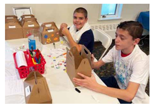
Grade 6 students assembled and decorated their own Tzedakah boxes.